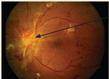
Severe vision-threatening proliferative diabetic retinopathy