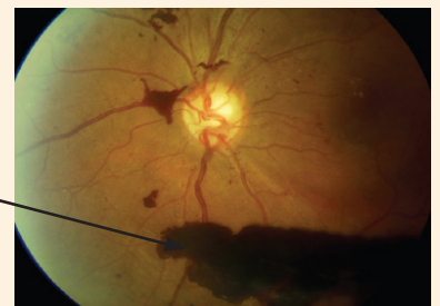
Vitreous hemorrhage from proliferative diabetic retinopathy