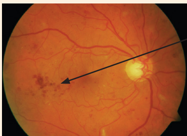
Spots of blood and lipid from non-proliferative diabetic retinopathy